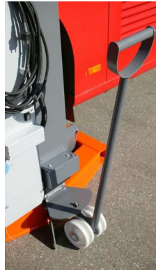
Detachable wheel handle