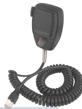
MICROPHONE in OPTION

The PPS-HD Siren can be fully controlled by Canbus PPS-HD is compatible with 8/11/16 ohms 100 Watts speakers It is fully configurable via the Speedfitter software It can be configured with 8 different tones (to be choosen in the 31 available tones). Vibrato, Night or Vibrato & Night functions can be combined with each tone PPS-HD is protected against loudspeaker failure such as direct short-circuit and allows a precise diagnosis through the LEDs monitoring PPS-HD has 4 inputs : Input 1 : Start/Stop Input 2 & 4 : Tones switch between 4 different tones or condition (Blue Light Enable) Input 3 : Tones bank change or night mode